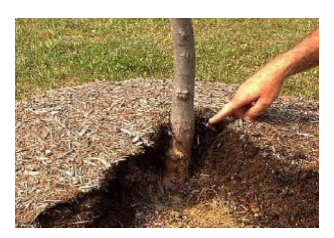
Proper Tree Mulching

Trees in the forest are accustomed to having a steady stream of leaf litter on their roots. In urban areas, proper mulching to simulate the natural forest floor environment in areas around trees is the single most beneficial thing one can do for trees.