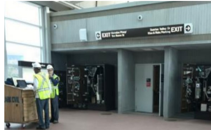
Fare Card Machine Installation