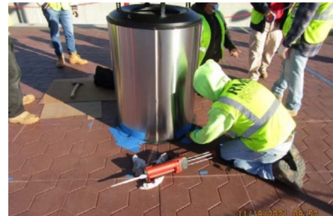
Trash Can Installation