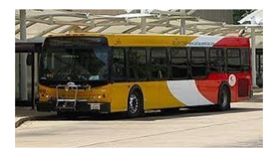
Department of Transportation