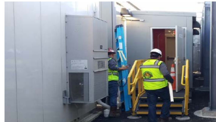
Tie Breaker Station (TBS) #16 Exterior Enclosure