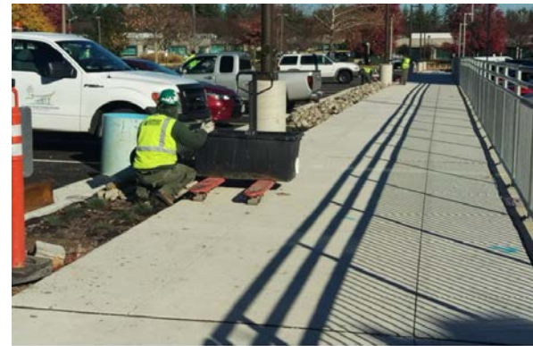
Placing River Rock at Herndon North Pavilion