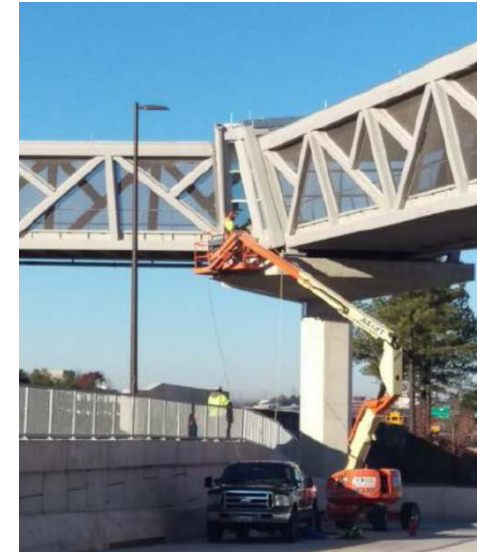
Finishing Trim on Reston North Ped Bridge