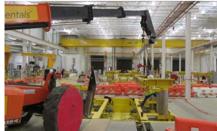
Hoist Installation in SIB