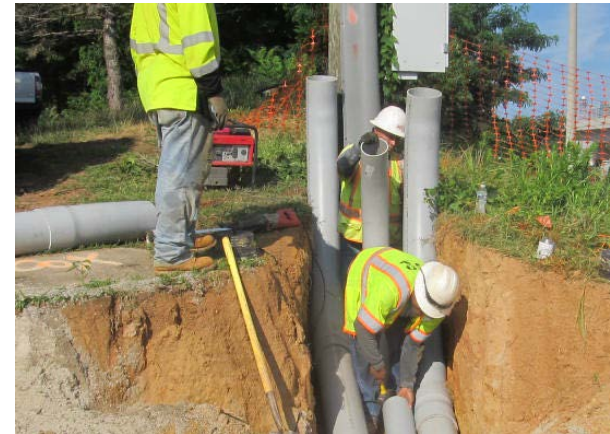
Conduit installation and tie-in