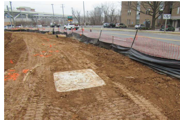
Area returned to grade