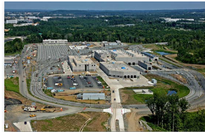
Dulles Rail Yard