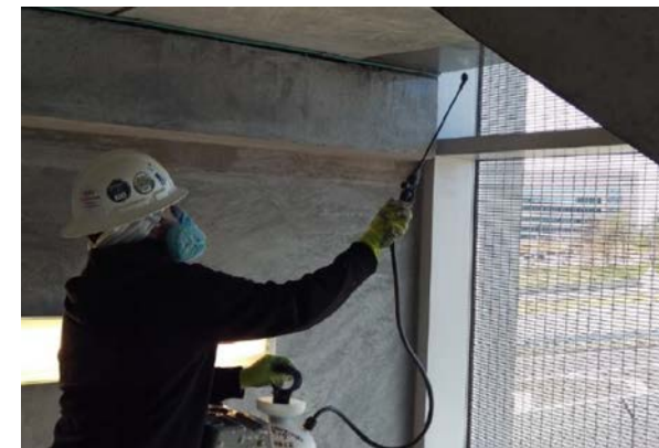
Applying Precast Sealant at Innovation Center Station Stair Tower