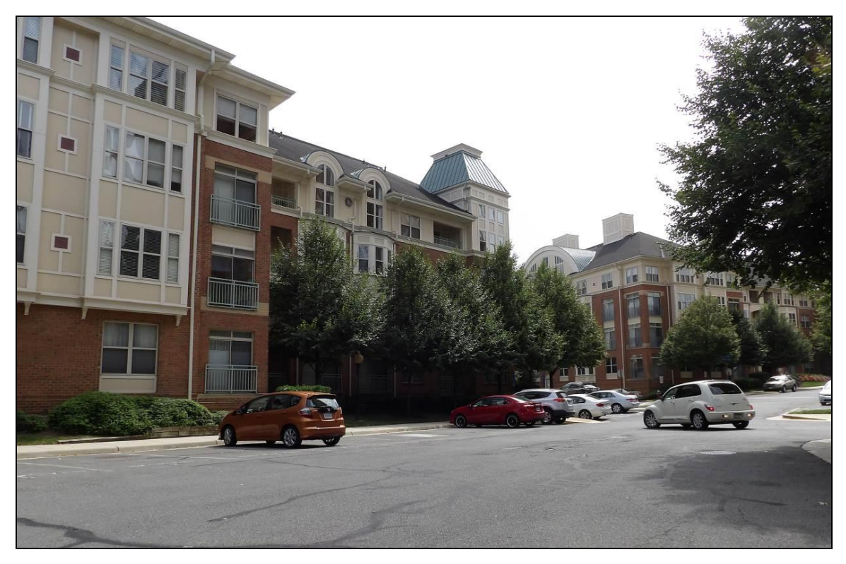
Photo 2: Wiehle/Sunset Hills Historic District (029-0014), Stratford House Drive, Looking Southwest.