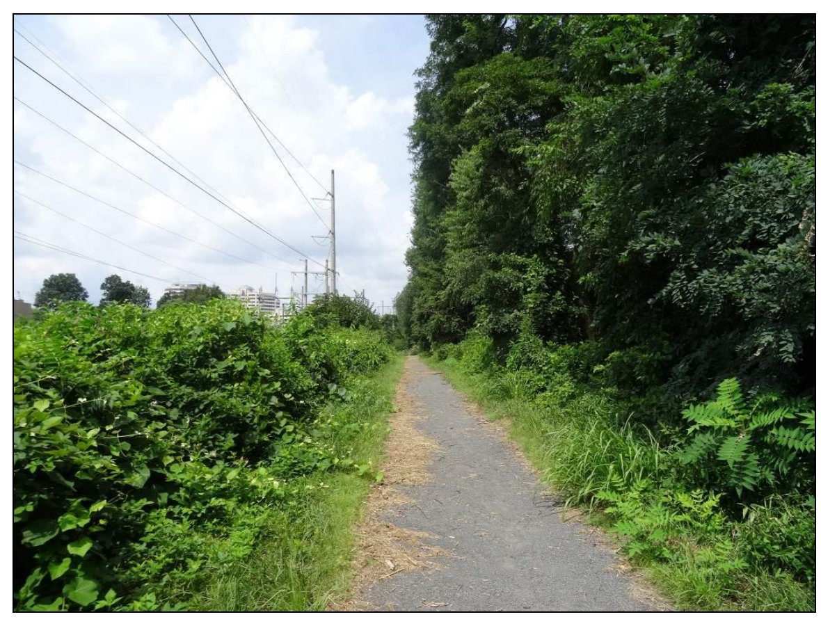
Photo 1: Washington & Old Dominion Railroad Historic District (053-0276), Looking West Towards American Dream Way.