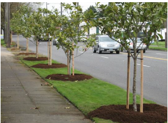
Decrease median width, increase planter strip width, and add trees (both sides)