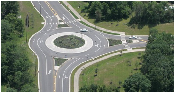
Convert to roundabout