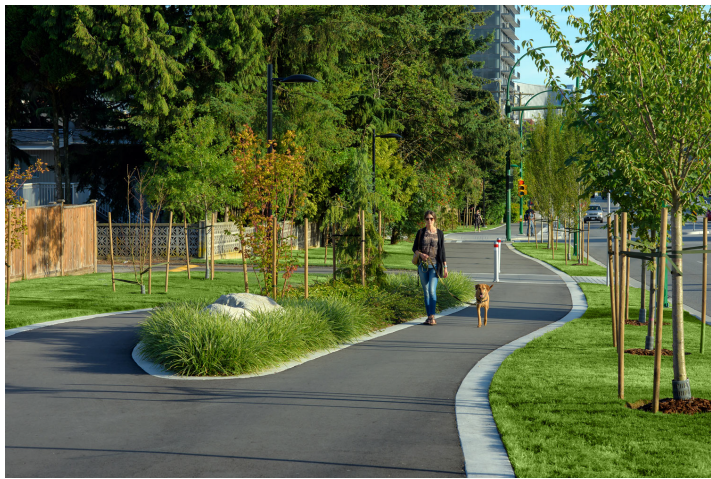
Opportunity for linear park

Reduce lanes and add sidewalk, protected bike lane, and trees