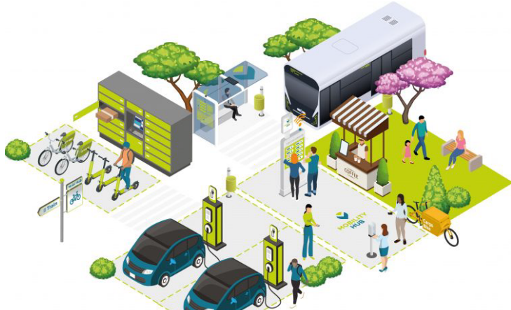
Opportunity for mobility hub

Reduce lanes, widen sidewalk, and add protected bike lane