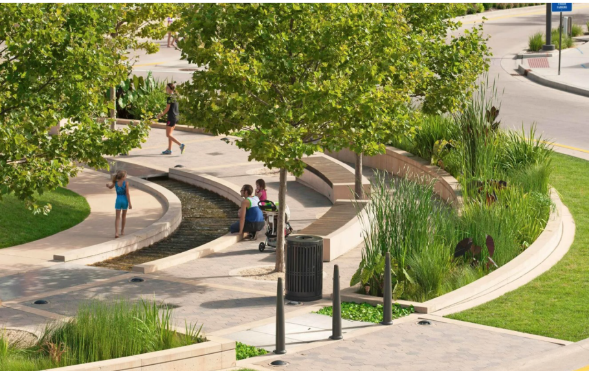
Opportunity for pocket park

Reduce lanes, widen sidewalk, and add protected bike lane and trees