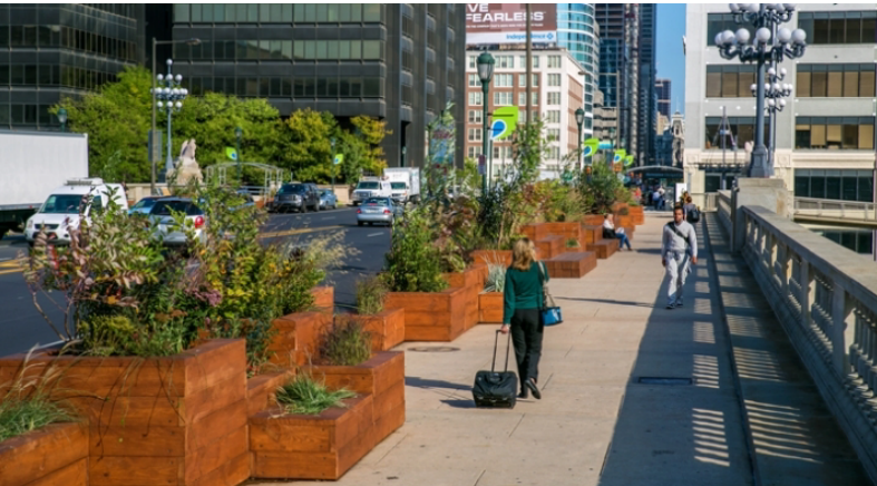
Opportunity for creative pavement design and planters (both sides)

Reduce corner radii (all corners) and add crosswalks across Wiehle Ave