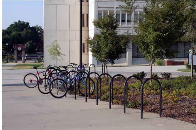
Opportunity for parklets, bicycle parking, and farmers market/vendor area

Reduce lanes, widen sidewalk, and add protected bike lane, on-street parking, and trees