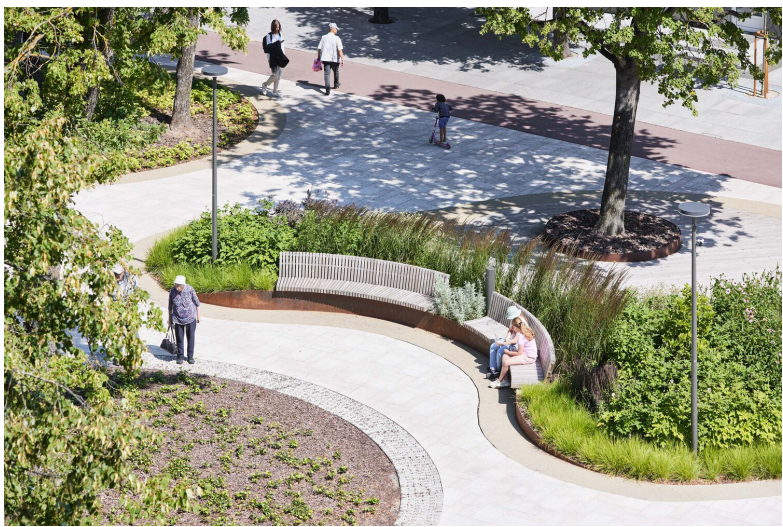
Opportunity for pocket park

Reduce lanes, widen sidewalk, and add protected bike lane, on-street parking, and trees