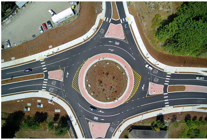
Convert to roundabout