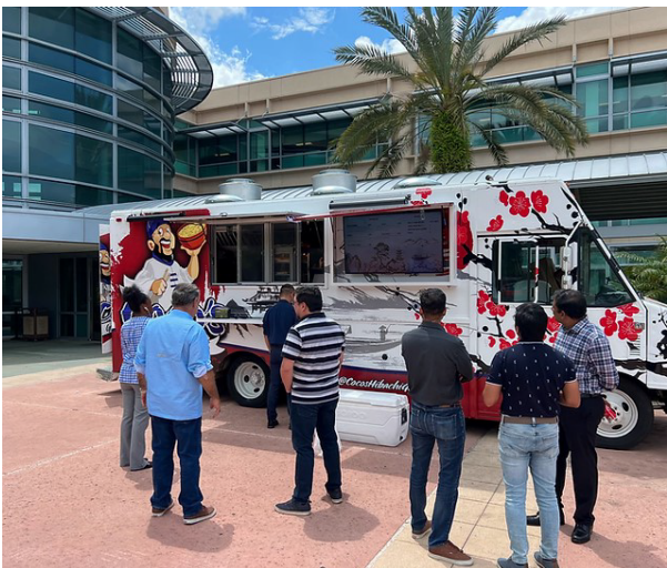
Opportunity for micro-mobility station/bike racks, creative outdoor seating, and food truck area

Reduce lanes and add sidewalk, protected bike lane, and trees