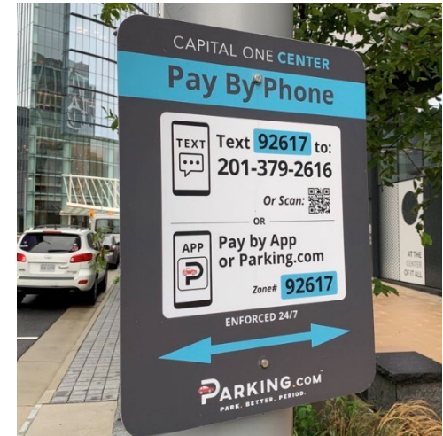
Capital One Tower Road, Tysons