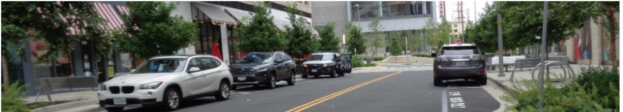
Boro Place, Tysons