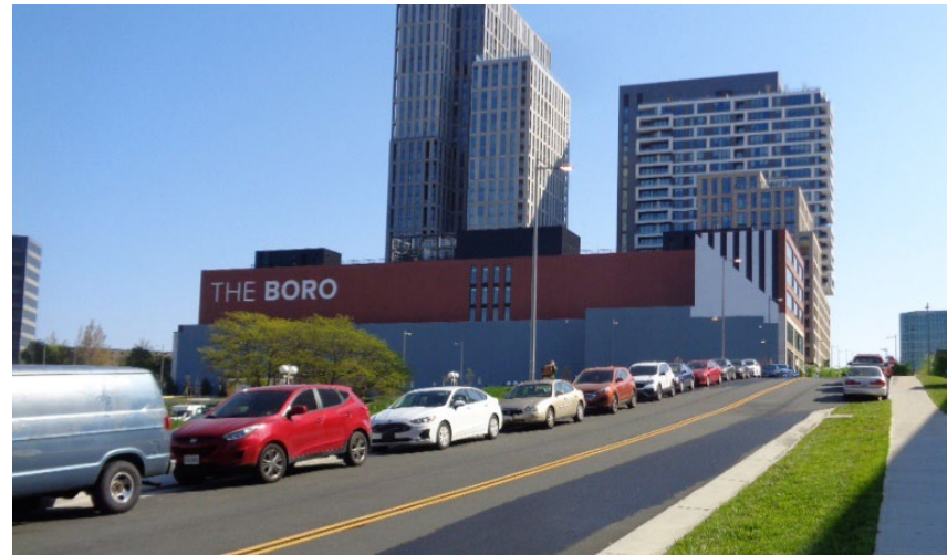
Lower Silver Hill Drive, Tysons

Do you support moving forward with the recommended concepts presented today?