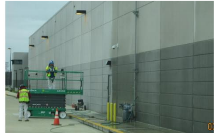
Power Washing Prior to Sealant Application