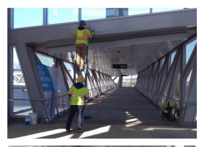
Touch-ups on Pedestrian Bridge In Reston