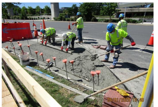
ADA ramp reconstruction along Route 7