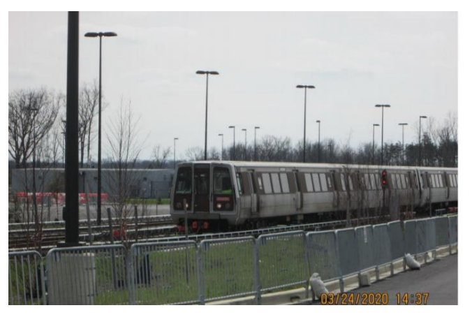
Rail Car Testing