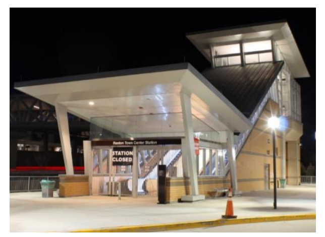
Reston Town Center Station Entrance Pavilion