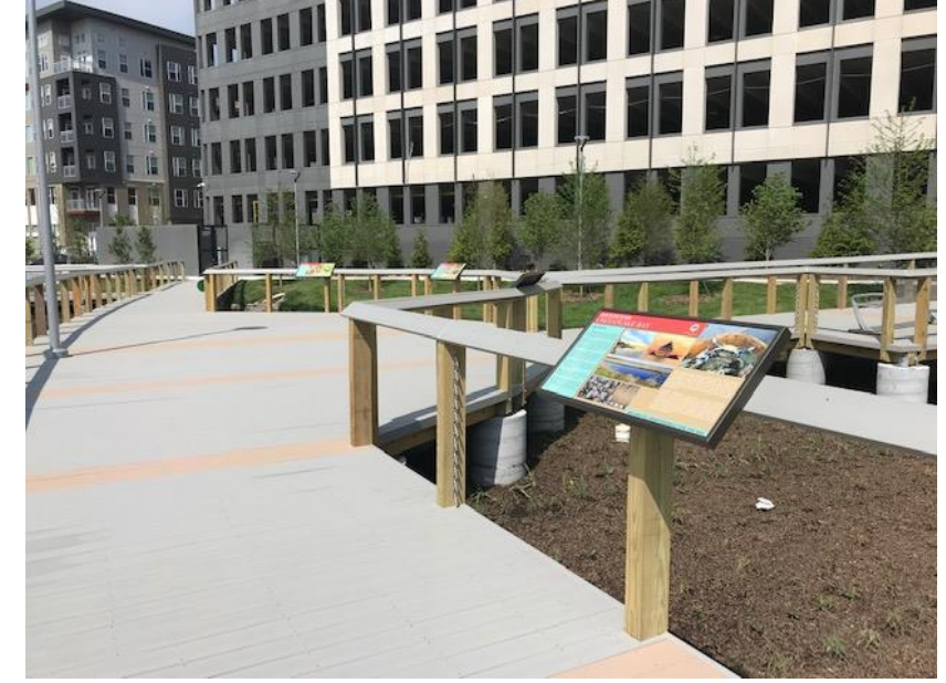
Innovation Garage Photos