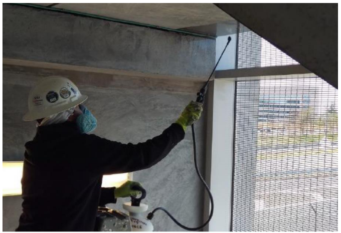
Applying Precast Sealant at Innovation Center Station Stair Tower