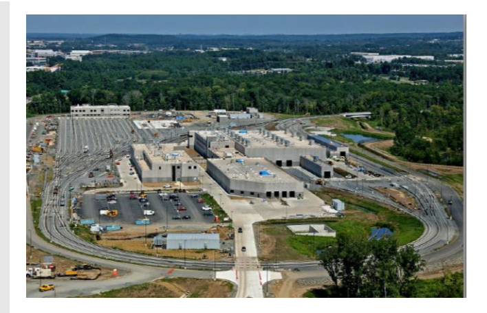
Dulles Rail Yard