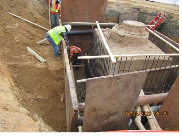
Communications vault work at Old Meadow Road