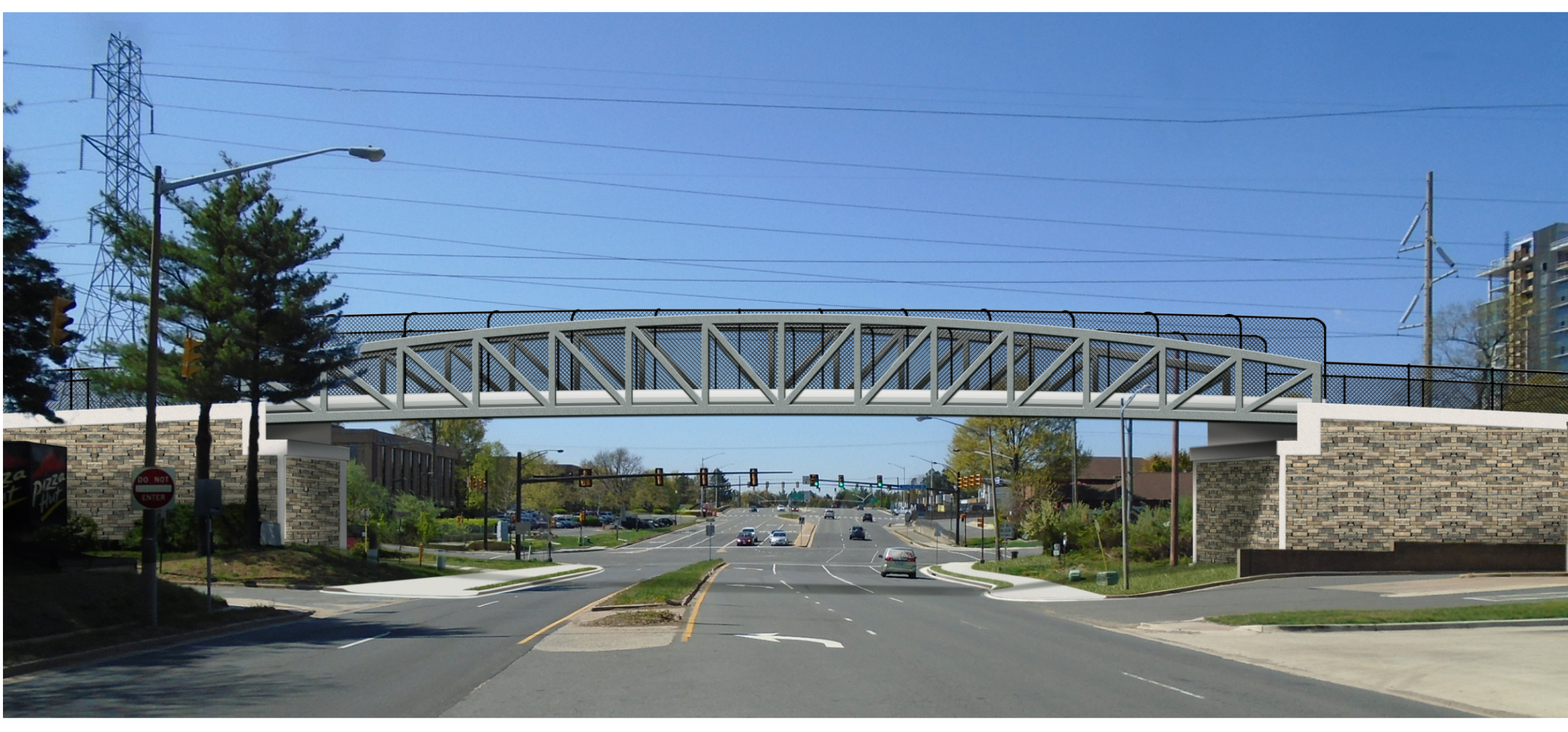
NORTH VIEW SOUTH VIEW