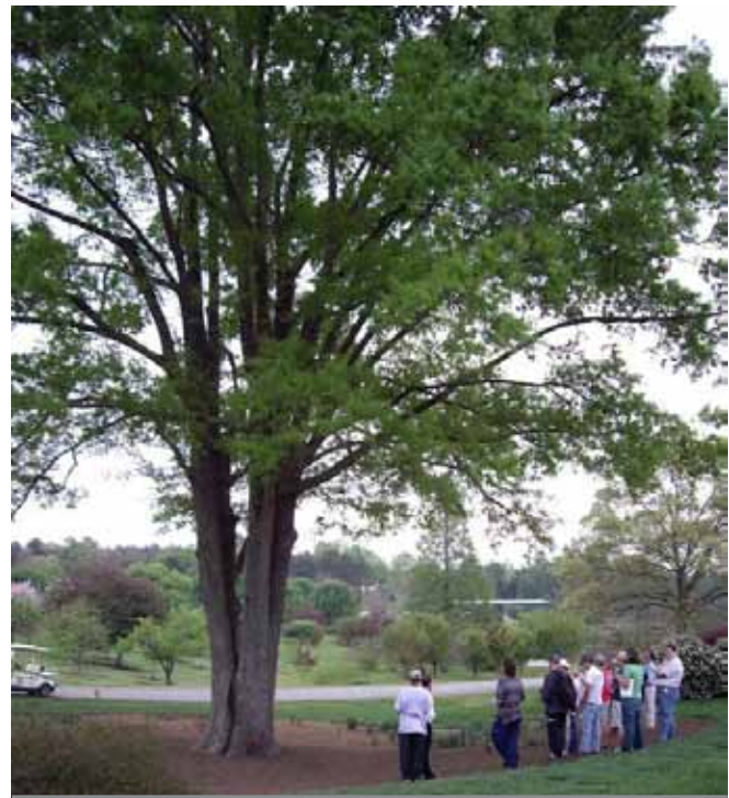
Admiring a Willow Oak, Quercus phellos

In 2009, the Fairfax County Urban Forest Management Division embarked on a project to measure and quantify the benefits derived from our trees on a countywide basis. State of the art forest analysis software from the